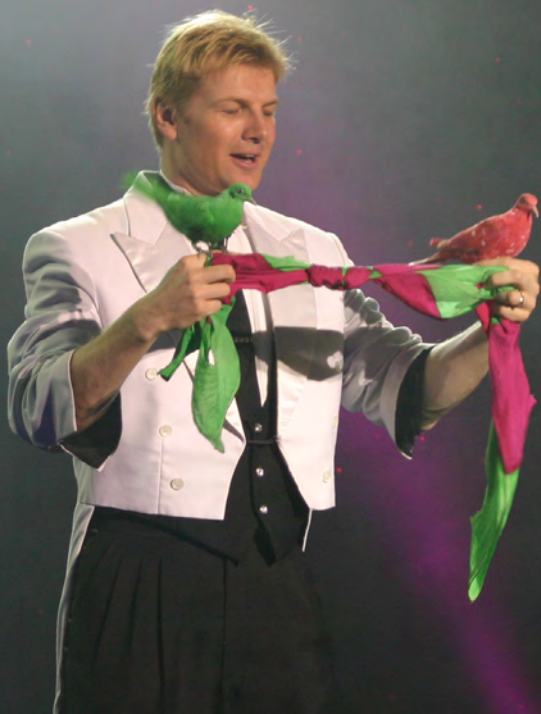
Dove production on Holland America's Zuiderdam, 2004.