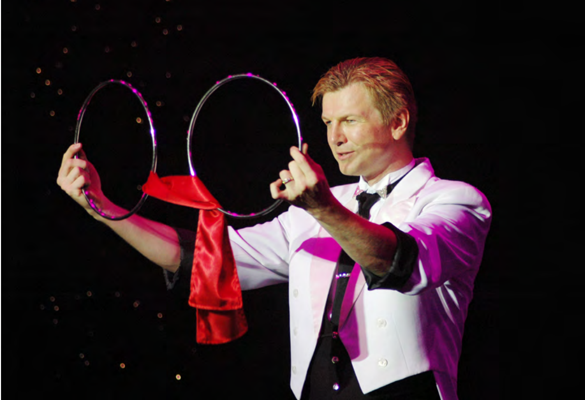
On stage with the Linking Rings, 2005.